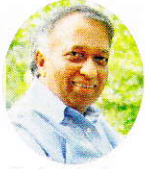
Padmabhushan Dr. Vijay Bhatkar